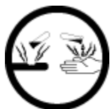
E – Corrosive