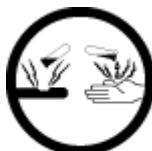
E - Corrosive

WHMIS 1988 Health Effects Criteria Met by this Chemical: