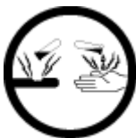
E - Corrosive

WHMIS 1988 Health Effects Criteria Met by this Chemical: