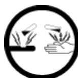
E – Corrosive

WHMIS Health Effects Criteria Met by this Chemical: