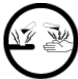
E - Corrosive