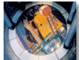
Terrazzo, Commercial Applications