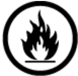
B3 – Combustible Liquid

B3 - Flammable and combustible material - Combustible liquid