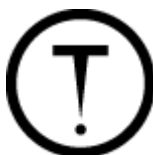
D2A – Very Toxic

D2A – Poisonous and infectious material – Other effects – Very toxic