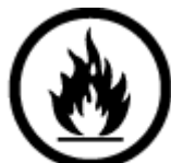
B3 – Combustible Liquid