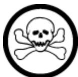
D1A – Very Toxic