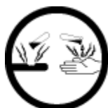
E – Corrosive