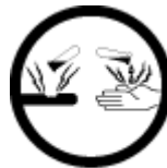
E – Corrosive